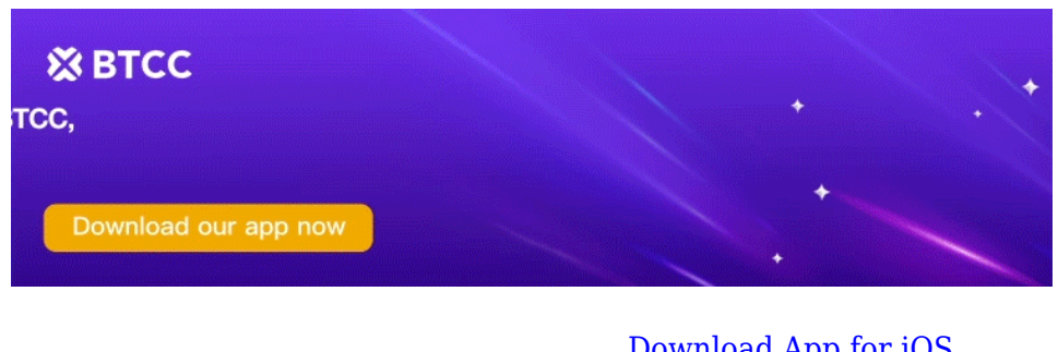
Download App for Android