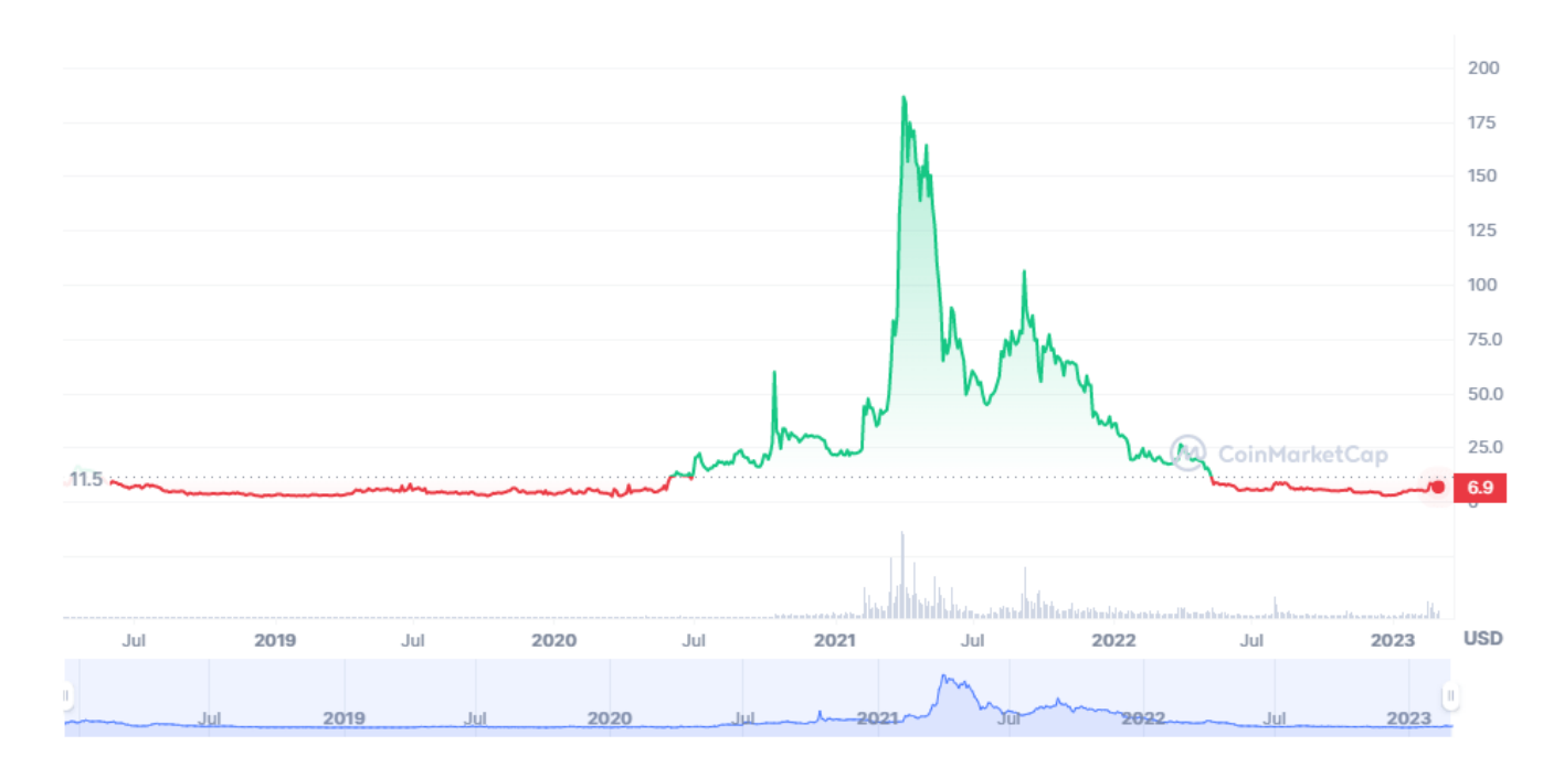
FIL price history from launch to present

First let's take a quick look at the Filecoin price history. While past performance should never be taken as an indicator of future results, knowing what the crypto has done in the past can give us some much-needed context when it comes to either making or interpreting a Filecoin price prediction.