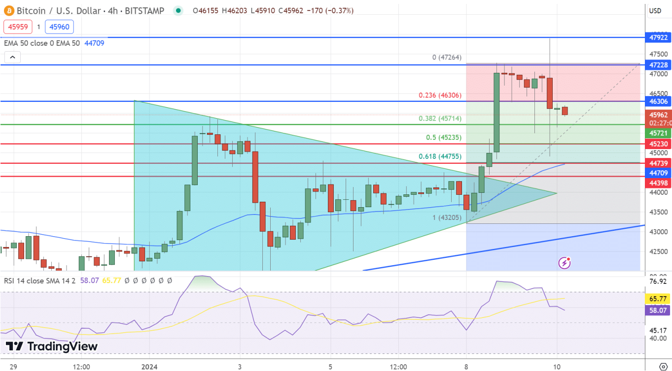
Bitcoin Price Chart

At its present level of 57 on the Relative Strength Index (RSI), Bitcoin’s mood is fairly bullish, but it is not yet overbought, which usually indicates a possible price retreat.